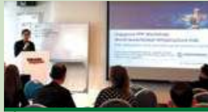
Workshop with Global Infrastructure Hub and World Bank, April 2019