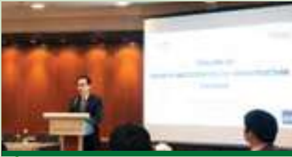
Roundtable Series with Asian Development Bank and Government of Canada, March 2019