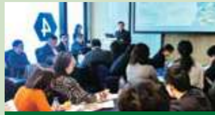
Dispute Resolution workshop in Beijing, China, December 2019