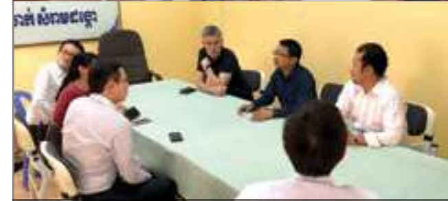
Meeting convened by IA for Cambodia's Ministry of Environment, KPMG and Ramboll to discuss pre-feasibility studies.