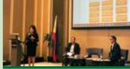
Easing Traffic Congestion through Smart Cities workshop in Manila, Philippines, July 2019