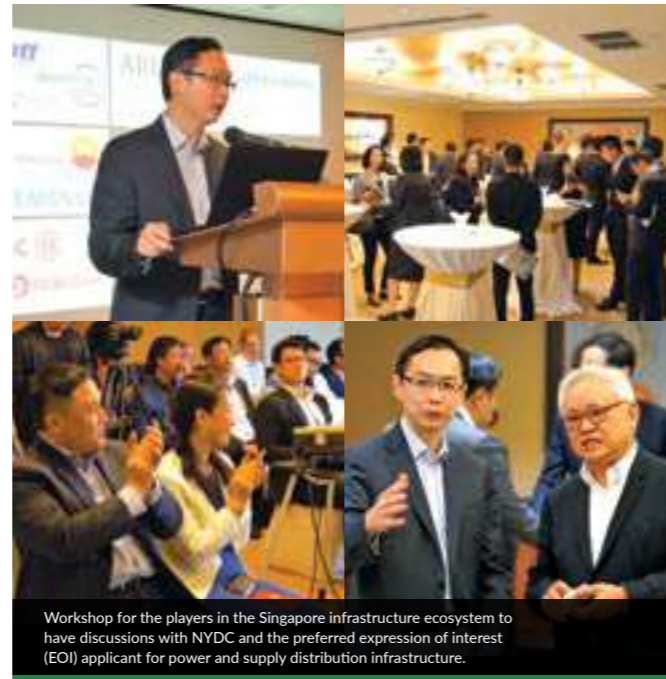
Workshop for the players in the Singapore infrastructure ecosystem to have discussions with NYDC and the preferred expression of interest (EOI) applicant for power and supply distribution infrastructure.

Tapping the knowledge and experience of various companies in the Singapore infrastructure ecosystem, we helped to scope the evaluation criteria for the development of power supply and distribution, natural gas supply and distribution, and cyber connectivity infrastructure under Stage 2 of the New Yangon City Phase 1 infrastructure projects.