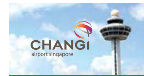
Changi Airport World's Best Airport for the 7 th consecutive year at the World Airport Awards (2019)

Singapore is #1 on the IMD World Competitiveness Ranking (2019), and #2 on Edén Strategy Institute's list of Smart City Governments (2018)