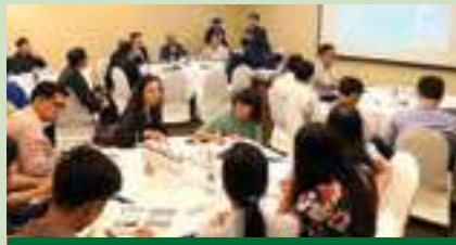
Waste-to-Energy capacity building workshop in Ho Chi Minh City, Vietnam, October 2019