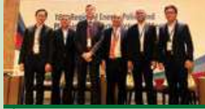
Optimising Investment Frameworks workshop for officials from the Association of Southeast Asian Nations, May 2019