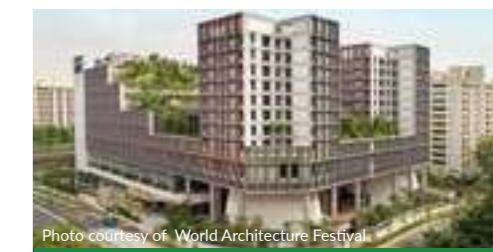
Kampung Admiralty Housing Project World Building of the Year at World Architecture Festival (2018)